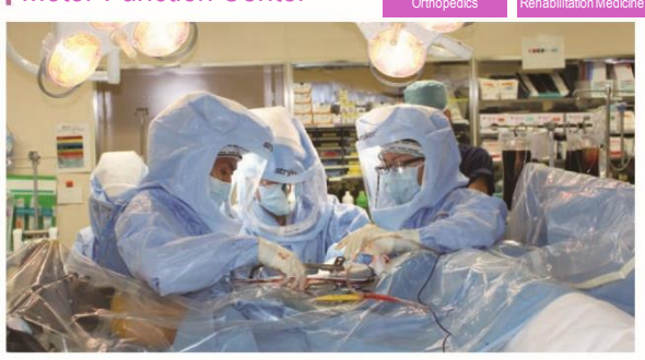
We provide proactive treatment of chronic diseases and emergency trauma, as well as occupational, physical, and speech therapy in a variety of settings.