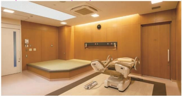
The OB/GYN ward was renovated in 2018.

Diabetes and Endocrinology/Metabolism Center