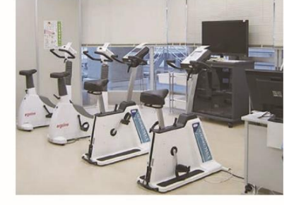
The program provides guidance and education on exercise therapy, lifestyle modification, etc. to patients suffering from heart disease.