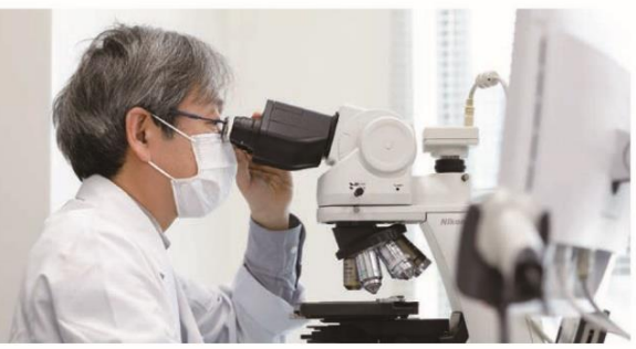
We are striving to improve the quality of pathological diagnosis by controlling the accuracy of immunostaining and introducing new antibodies.